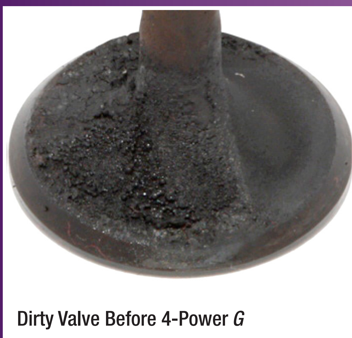
Dirty Valve Before 4-Power G