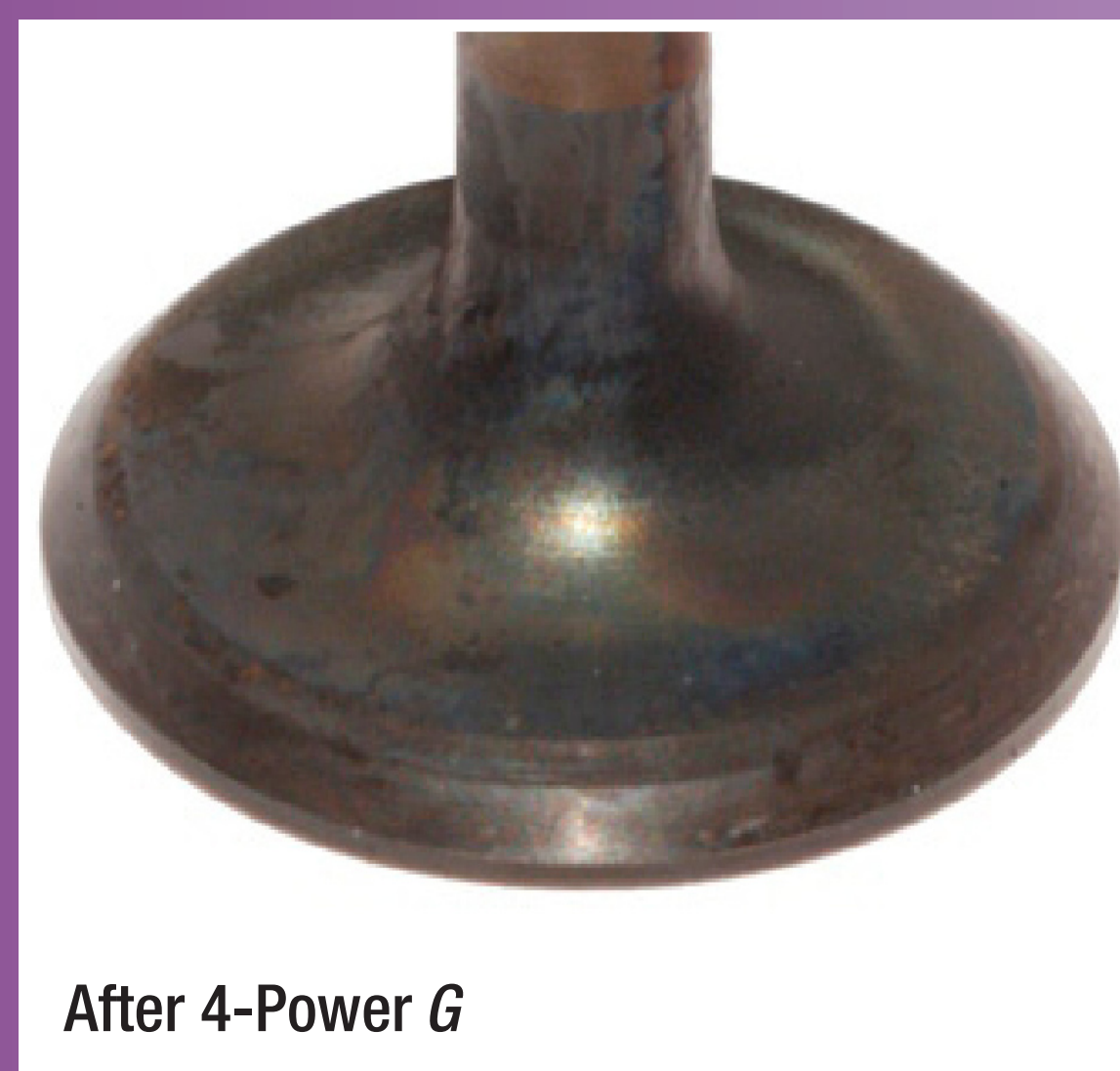
After 4-Power G