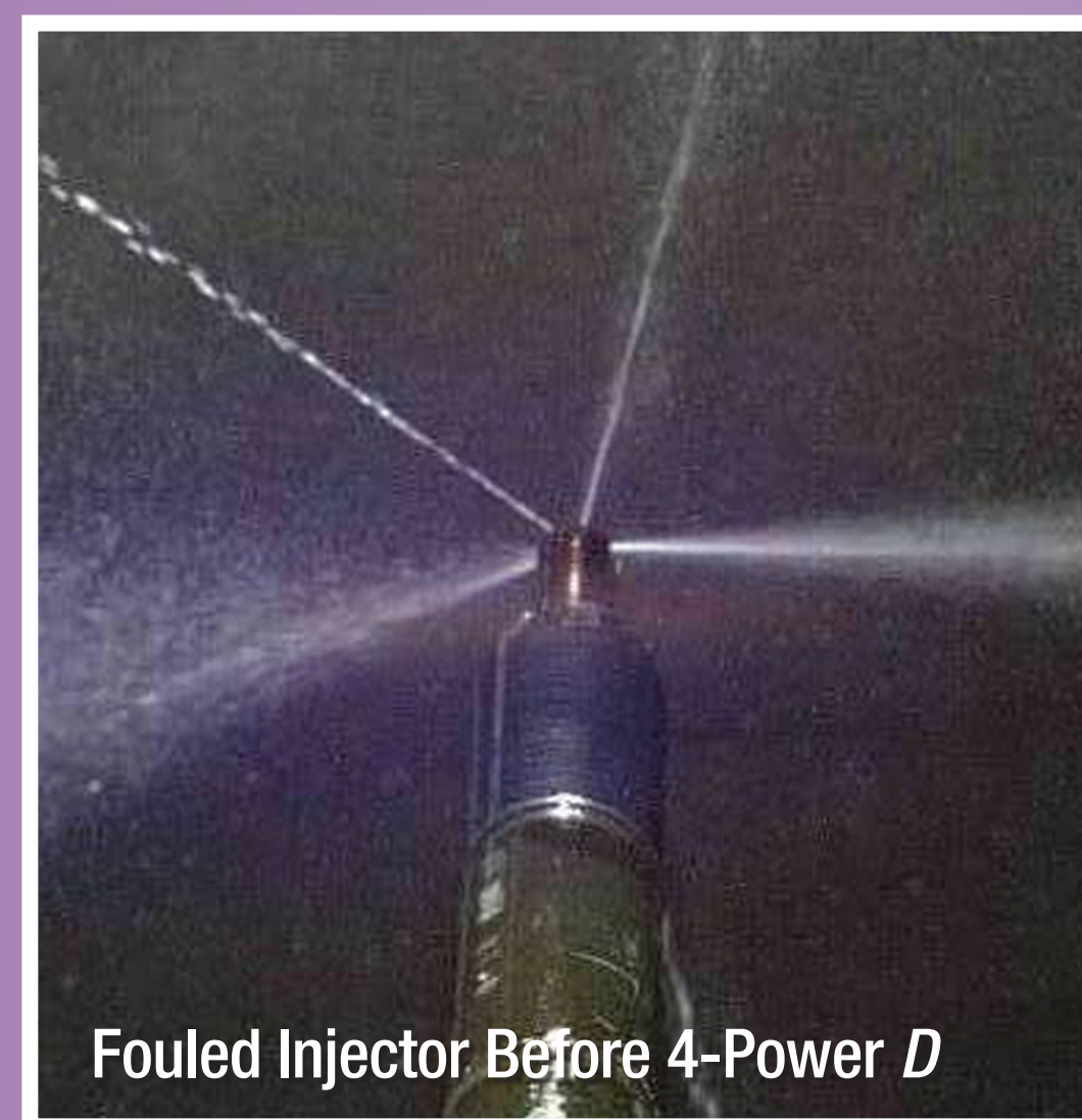
Fouled Injector Before 4-Power D