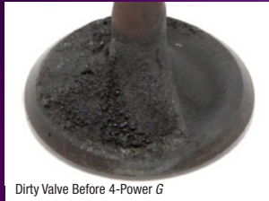
Dirty Valve Before 4-Power G