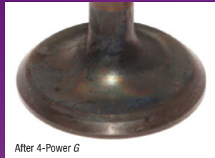
After 4-Power G