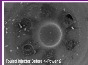
Fouled Injector Before 4-Power G