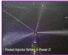
Fouled Injector Before 4-Power D