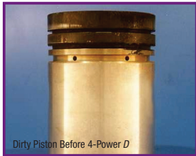
Dirty Piston Before 4-Power D