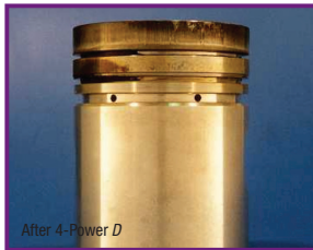
After 4-Power D