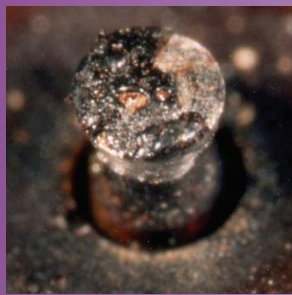
Injector pintle - a fuel system conditioner has not been used