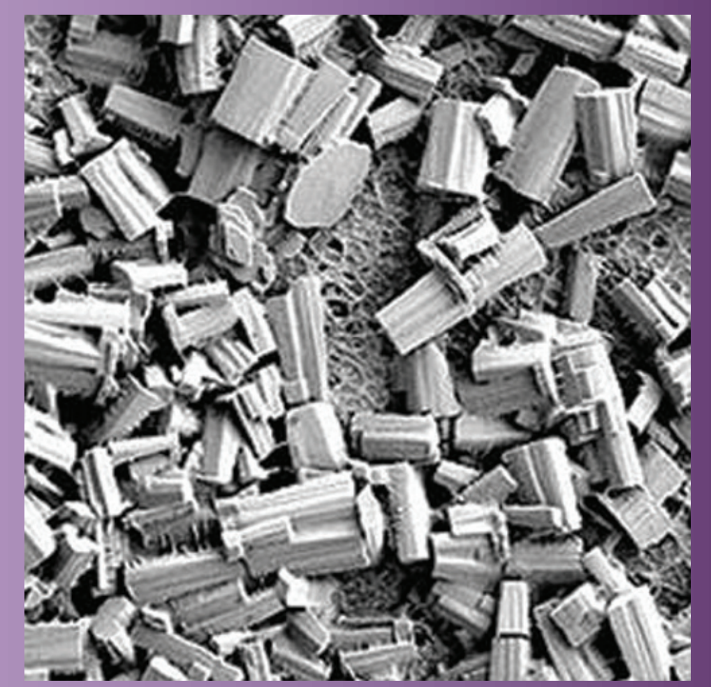
Wax crystals in Diesel fuel treated with Diesel Plus