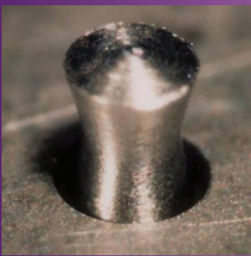
New injector pintle