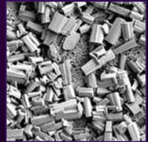
Wax crystals in Diesel fuel treated with Diesel Plus