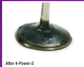
After 4-Power G