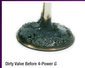
Dirty Valve Before 4-Power G